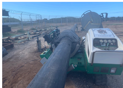
HDPE Fusion Equipment and Training