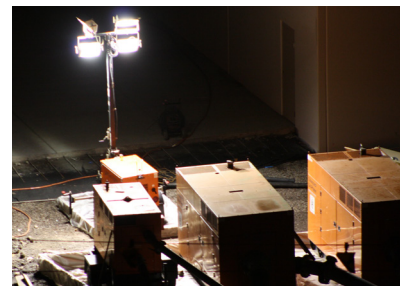
Diesel, Electric & Battery Powered Light Towers