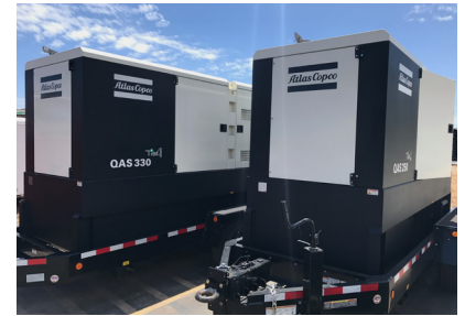
Portable & Standby Generators