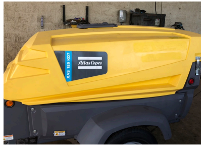
Portable & Industrial Air Compressors