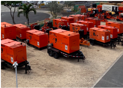
Dri-Prime Pumps for Sewer Bypassing & Dewatering