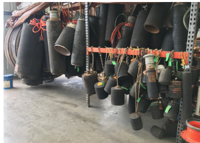
Pipe plugs, Vacuum, Joint & Mandrel Testers