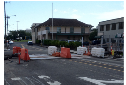
Flanged Road Crossings in a Range of Sizes